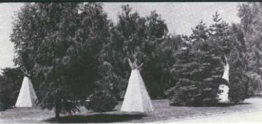
Teepees Hiding Among the Trees of the Boulevard Park. Good Atmosphere of the Indian Love and Tradition.