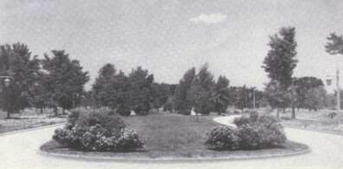
Trees, Shrubs, Flowers or Fountains Add Enchantment to the Natural Landscapes.