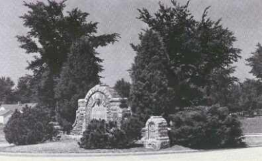
A View of the Entrance to the Village—Beautiful, Impressive, Inviting.