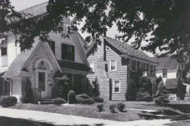
View of the Original Indian Village Homes on Ogden Way.