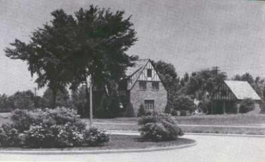
A Beautiful Home of Spacious Setting and Landscaping on Indian Village Boulevard.