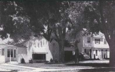
A View of Two of the Attractive Homes on Main's Boulevard.

T HE Association not only sees that the simple but important restrictions are adhered to but is otherwise interested in the proper maintenance of the residential area to the mutual advantage of all concerned. Functions within the scope of the organization include keeping the sidewalks cleared of snow, removing the grass and weeds from vacant lots and maintaining the grass and planted areas within the boundaries of the streets in good order and other services of a similar nature. The Association also looks after civic affairs to directly advance the interests of the Community. For instance, a committee has recently been named to confer with the proper officials relative to the selection of a school site within the area.